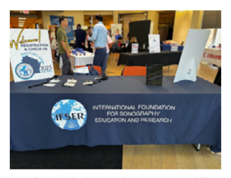
Caption/Description: The IRN hosted a "Research Corner" at the IFSER Educator's Summit in June.